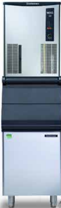
MODEL: MXG 328 145KG +/-