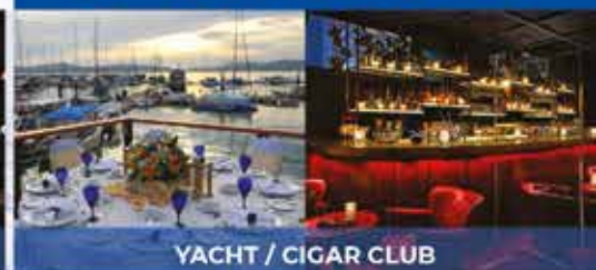
YACHT / CIGAR CLUB