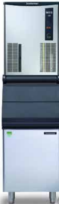
MODEL: MXG 428 185KG +/-