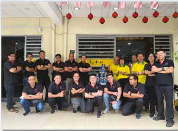
Charity Center in PJ Old Town ►