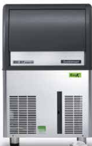
MODEL: EC 87 36KG +/-