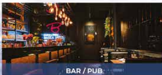
BAR / PUB