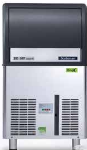
MODEL: EC 107 47KG +/-