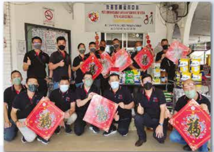
◀ Good Heart Charity Home Alor Setar, Kedah