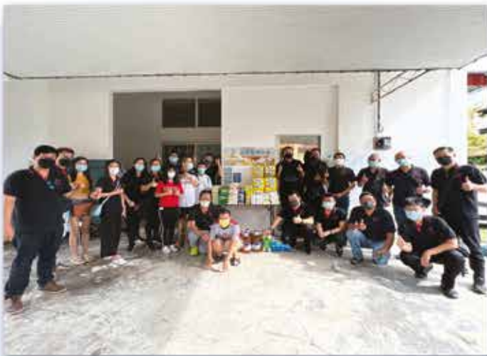
Pertubuhan Penyayang Hospis Pure Lotus, Pulau Pinang ►