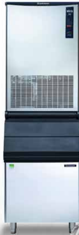
MODEL: MXG 638 315KG +/-