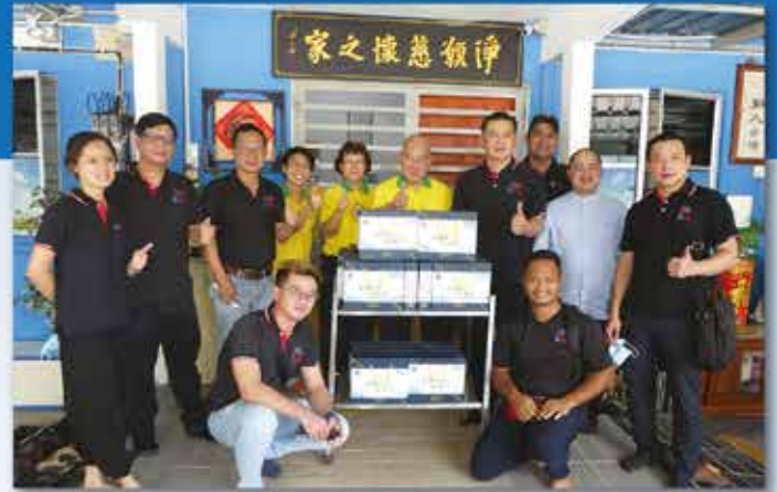
◀ Pertubuhan Kebajikan Rumah Kasih Jing Yuan Cheras