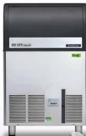
MODEL: EC 177 77KG +/-